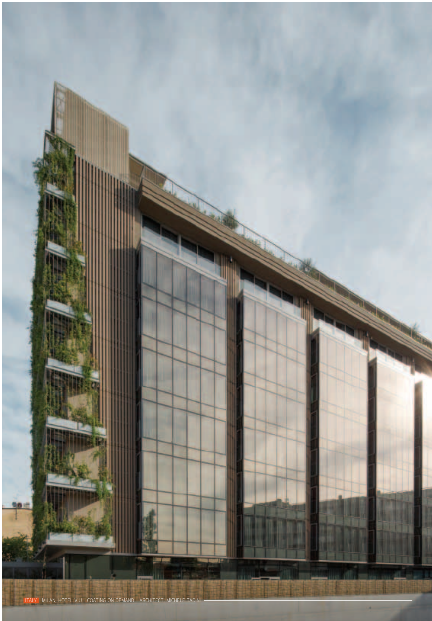
ITALY | MILAN, HOTEL VIU - COATING ON DEMAND - ARCHITECT: MICHELE TADINI