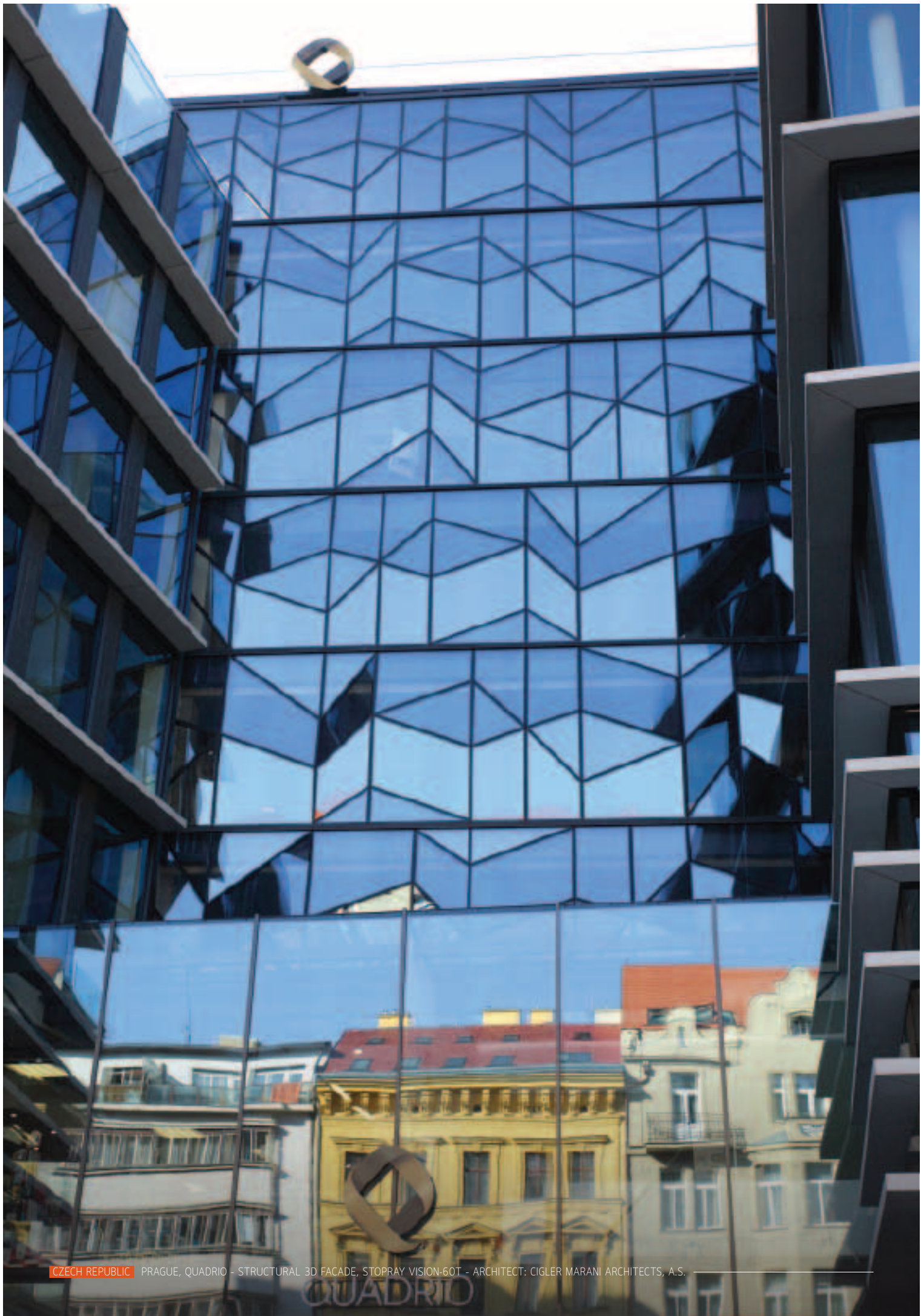
CZECH REPUBLIC PRAGUE, QUADRIO - STRUCTURAL 3D FACADE, STOPRAY VISION-60T - ARCHITECT: CIGLER MARANI ARCHITECTS, A.S.