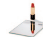
Clearvision Highly neutral float base for pure aesthetics