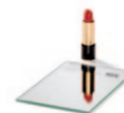
Clear Normal float base